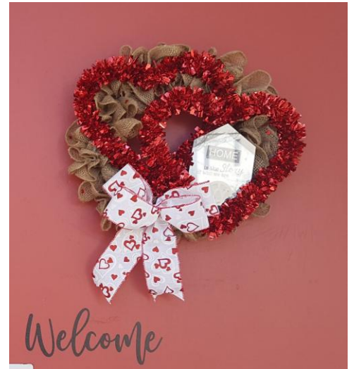
Home is the story of who we are!