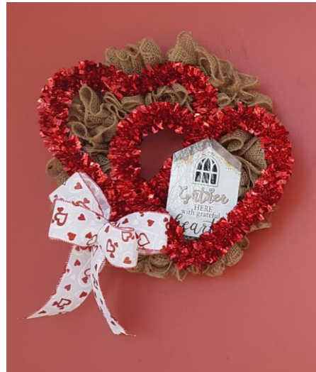
Gather here with grateful heart!