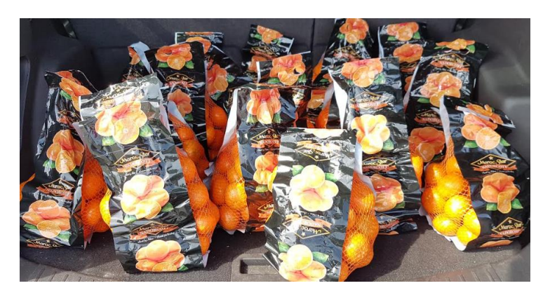
Lift also supplied St Rose school with 20 bags of clementines as a special treat during their Spring Fling Week celebrations.

The Caring Card project continues and over 20 cards have been sent out to date this year. If you know of someone who needs a "LIFT", is celebrating one of life's special moments or perhaps should be recognized for an accomplishment, please let our Lift members know.