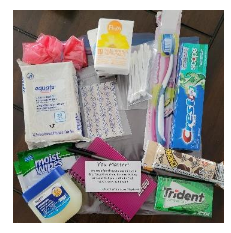
Homeless Care Packages

Lift continues to meet on the second Thursday of the month at our new time of 2pm in the small hall. The meeting time change has been very popular with our members, and we are seeing an increase in the number able to turn out to our meetings. Our February fundraiser, the Bakeless Bakesale, was a phenomenal success and the ladies were busy preparing care packages for the homeless from the proceeds of this fundraiser. In total 35 care packages, 30 feminine specific care packages, and 30 small safety kits were assembled and delivered to the local Homeless shelter and the Coverdale Emergency Shelter for Women.