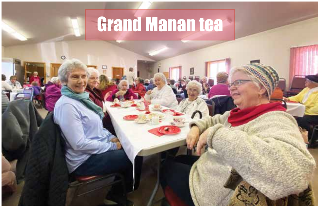
St. Paul's ACW on Grand Manan hosted a tea on Feb. 11, the first tea since the pandemic began, and it was a full house. All the monies they raise are used to support local families in need, newly arriving Ukrainians to the island, upkeep of the church and hall and the list goes on.